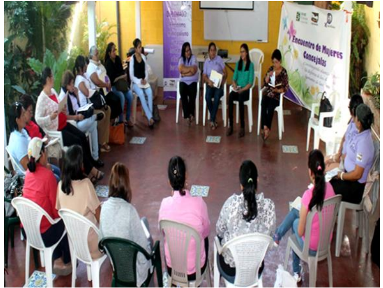
Women attend a workshop as part of the leadership training.