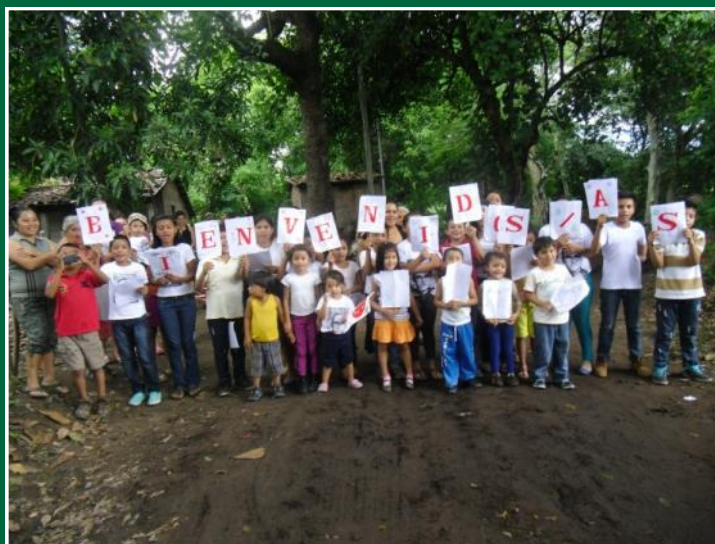
The Good Shepherd delegation gets a warm reception from the children of El Buen Pastor.

As SHARE turns 35 this year, we continue to learn from the amazing examples of solidarity that our supporters and communities show!