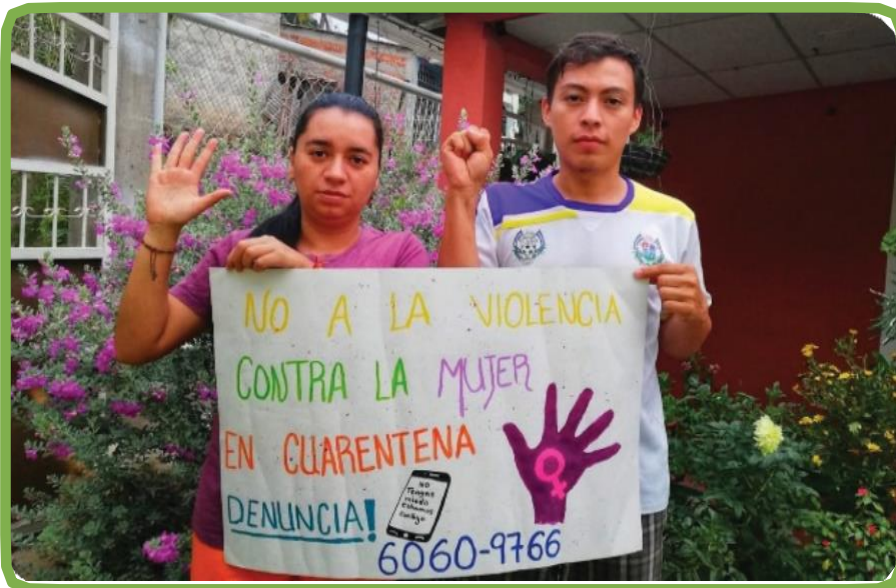
During the COVID-19 pandemic, a virtual campaign on violence prevention was promoted, since due to confinement there was an increase in cases of domestic violence, where women were the most affected.