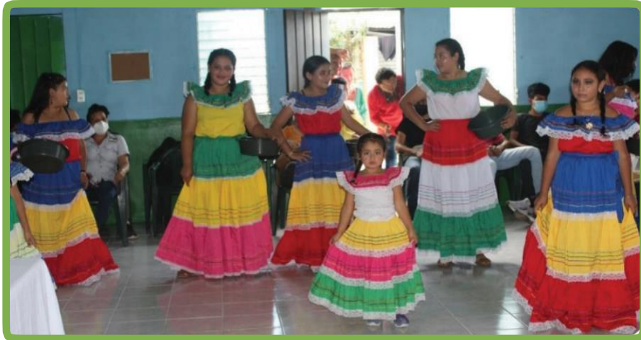
Four groups of folk dance were supported with training on folk dance the provision of typical costumes, and a peace band.