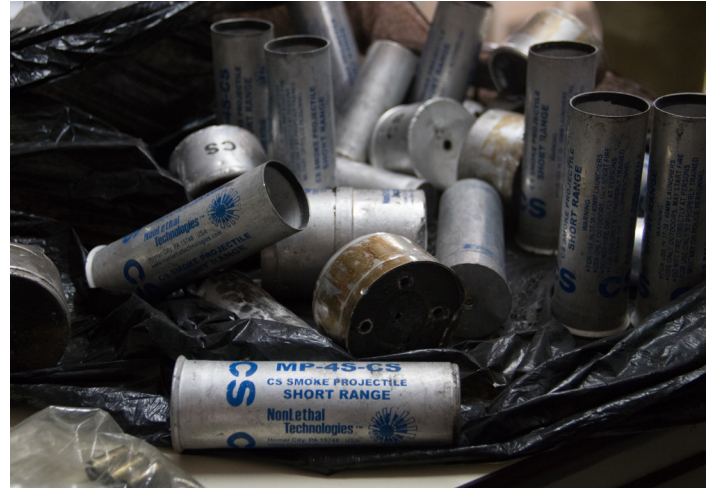
Spent canisters of U.S.-made tear gas used against people protesting alarming irregularities in the 2017 election.

According to Reuters (March 30, 2019), the U.S. provided about $98 million to Honduras in 2016 alone (the latest year on which they have reported). U.S. money continues to fund the militarization of police and security forces, and buys weapons, technology, and surveillance equipment manufactured by U.S. companies.