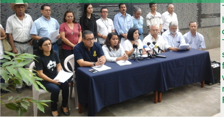
Tutela Legal convenes with human rights leaders demanding justice for the victims

for truth and justice with the reopening of the El Mozote case; one of the largest massacres of the continent.