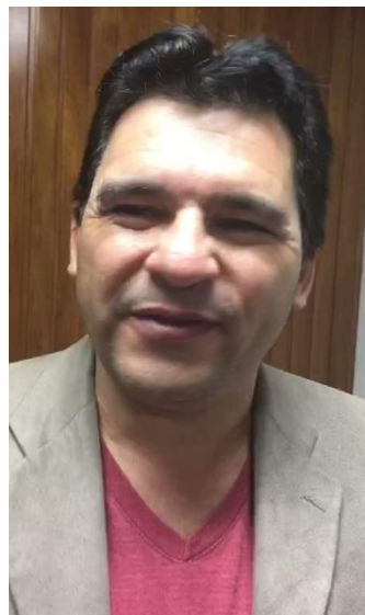
"I feel ashamed for the institutions of my country"

Another expressed, deep concern over the process, saying "how dare the Justice Ministry present all these accusations, ones with such grave consequence, such as illicit association, that are applied only in