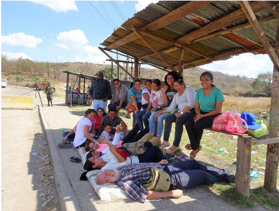
A few of us resting outside the prison

The next day? Another surprise. We arrived to find that over 500 police and soldiers had arrived at 2 a.m. to search the jail for contraband, and were told that there could be no movement of any prisoners until the search was complete. They finally left at 3:30 p.m. Another act of harassment?