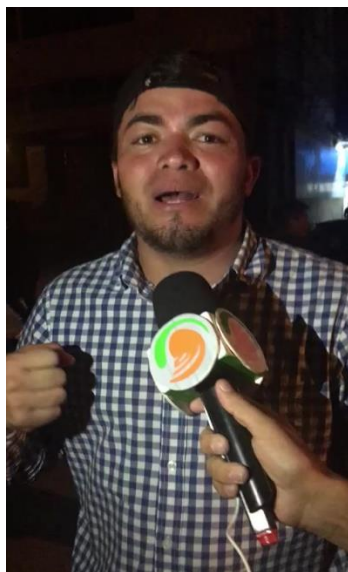
"We did it!"

Outside the court, in middle of the jubilant crowd, one attorney says, "We did it! We did it! I can't describe how happy I feel."