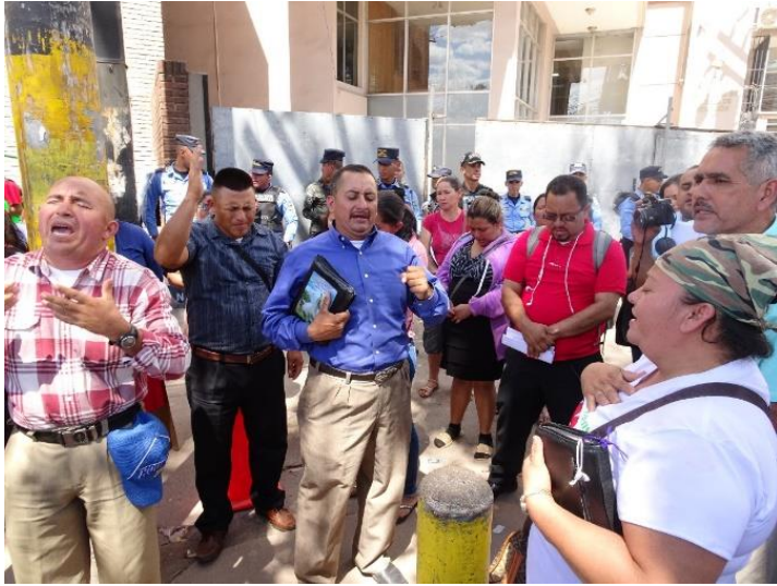
Sun of Justice Evangelical Church