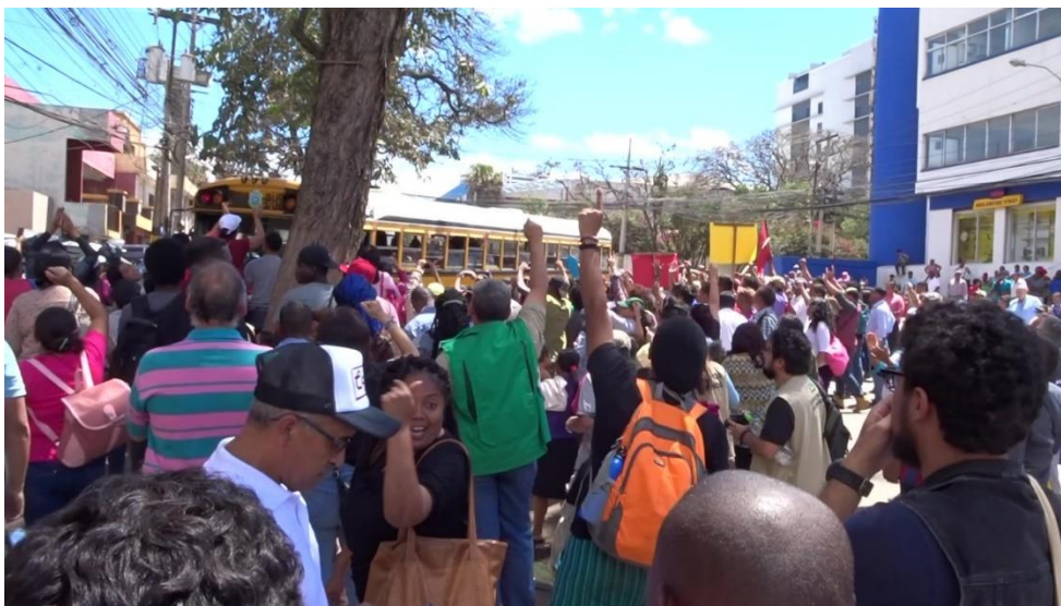
Environmental defenders entering the courthouse (in the school bus), day 1 of 4 of the hearing