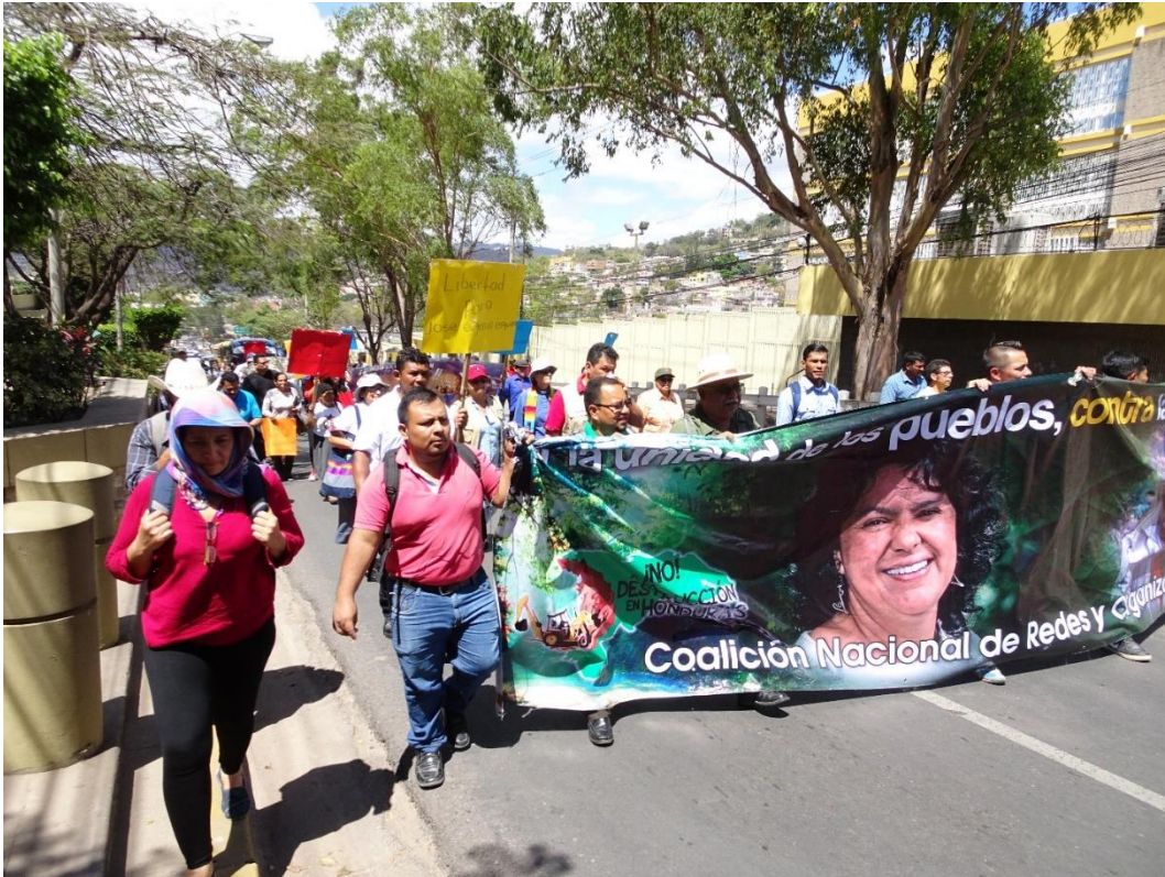
Marching past the U.S. Embassy in Tegucigalpa on the way to the court building the first day of the hearing. The United States is named, over and over again by Hondurans, as a major force in promoting and maintaining an unjust system in their country.

The team of about six defense attorneys first tried, unsuccessfully, to get the judge declared as incompetent in the subject matter and, from there, seemed to try to guide him as to how to carry out his job. The prosecuting attorneys, from the Justice Ministry, presented accusation after accusation that was backed up only by declarations substantiated by, at best, circumstantial evidence that never quite provided any proven relationship with the accused. The defendants, taken aback by the affront of the indignity of nights and days in prison and the unfounded accusations against them sought to provide moral support to one another. They declared, "Guapinol is wounded, but not defeated."