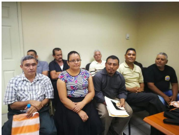
Guapinol Defendants voluntarily appearing at court in La Ceiba 2/22/19

To their surprise, they find themselves being accused of more serious crimes, including usurpation (taking over) of private property (even though they were occupying a public road) and of organized crime(!). They were then arrested and driven nearly 300 miles across the country, to be held in a huge federal penitentiary and the neighboring women's prison, from which they were taken handcuffed to Tegucigalpa to attend hearings on the merits of the accusations. Under the more serious crimes they were accused of, they faced the prospect of about 2½ years in preventive detention before the case even went to trial, and between 46 and 71 years in prison if they were found guilty on all counts.