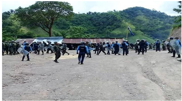
Soldiers and police marching to evict encampment 10/27/18 - photos by Criteria.HN - Eviction of encampment

Fast forward to February 22, 2019, when twelve people from Guapinol voluntarily present themselves to the regional court in the city of La Ceiba to answer to charges of destruction of property in relation to the vehicle that was burned on September 7, and, on the same day of illegal deprivation of liberty, of the head of private security of Inversiones Pinares, who had been taken by the community and turned over to the police, under suspicion of having fired upon the protesters.