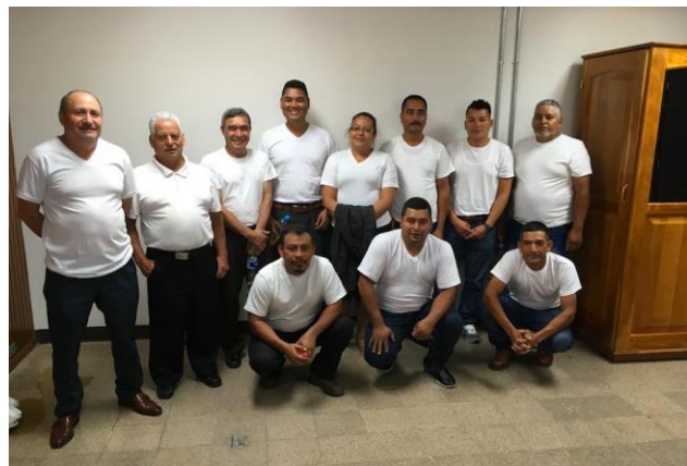
Defendants (in white) first day of hearing, 2/28

Thus, began the 12-day ordeal before finally, perhaps miraculously, they were released, with all charges against them dropped.