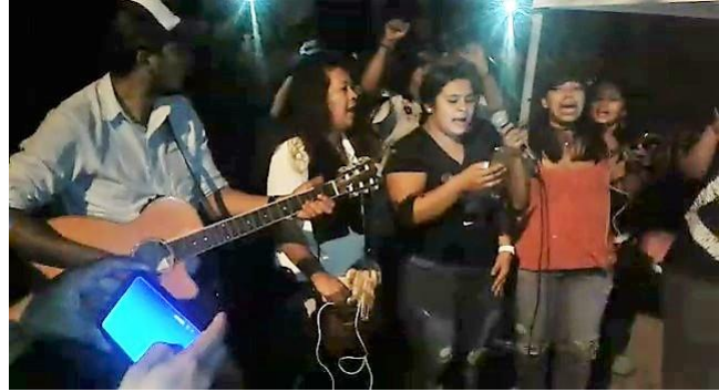
Outside on the 2 nd night, when the hearing went until 3 a.m.

Finally, on the fourth day, which was a Sunday that stretched into the wee hours of Monday, the hearings concluded. The judge called up a series of witnesses, mostly for the prosecution, to the stand. A large man accused the more diminutive defendants of beating him up, but no evidence is provided. The head of the private security detail for the mining company accuses the defendants of attacking him, burning his vehicle, stealing from him but, again, no supporting evidence is provided. Upon cross examination by the defendants' attorneys, it is revealed that violence did take place on that day (September 7 th , 2018), but this same witness named one of his security guards as the one who shot and wounded one of the protesters. Upon the charge of illegal deprivation of freedom, it was shown that community members did detain this witness, under suspicion of having shot a protestor, and turned him over to the police within a matter of hours, a procedure that is fully within the law. The strange thing was, that very same day, he filed a police complaint against those persons, who later became defendants in these hearings, and was able to provide their complete names, even though he barely knew them. A police forensics investigator, supposedly with 11 years' experience, was unable to provide a positive match of the license plate number with that of vehicle purported to having been burned, nor could he provide a vehicle identification number.