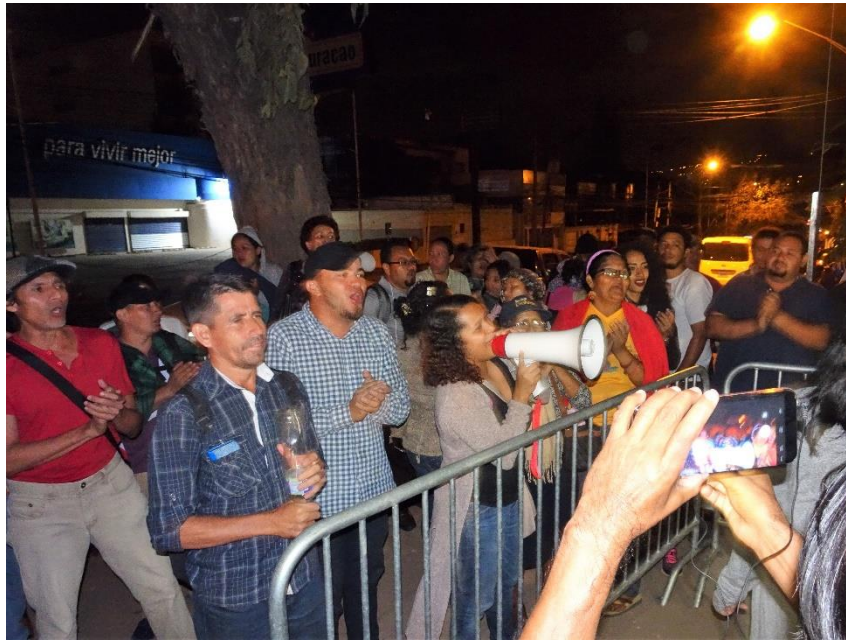
2 a.m. Monday March 4, outside the courthouse, celebrating the news

cases of organized crime and carry a sentence of 20 to 30 years in prison! Not only that, they added on various accusations, all of which they were unable to prove, even in the most minimal way, the participation of the accused. It's that not only do they need to prove that a crime took place, but they have to prove that the accused took part in it..." "I am happy now, on the one hand, that these brothers and sister will be freed, but, on the other hand, as a citizen of this country and a practitioner of law, I feel ashamed for the institutions of this country..."