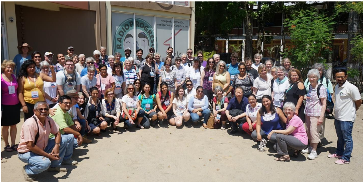
In 44 years SHARE has organized 10,160 delegates to El Salvador and Honduras

These incredible gifts extend their solidarity into the future and secure SHARE's mission to continue accompanying the peoples of El Salvador and Honduras, especially organized women's communities and young men and women, boys and girls.